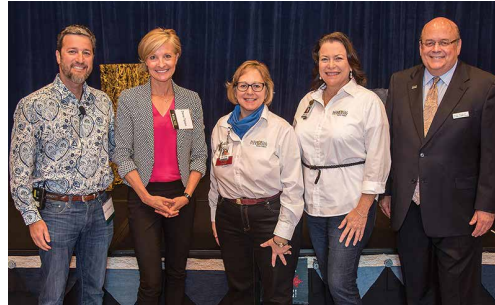
Giving Cancer the Boot: Memorial Hermann Cancer Centers celebrated National Cancer Survivors Day at The Westin Houston-Memorial City on June 3.