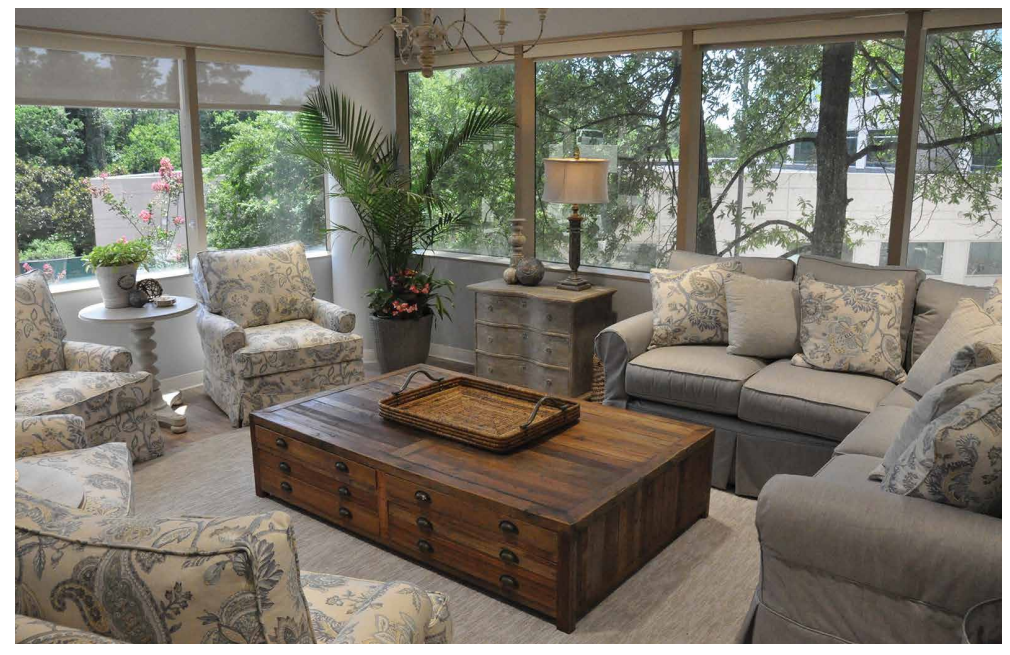
Canopy - A Cancer Survivorship Center in The Woodlands

To receive the Memorial Hermann Cancer Journal via email, please sign up online at memorialhermann.org/cancerjournal.